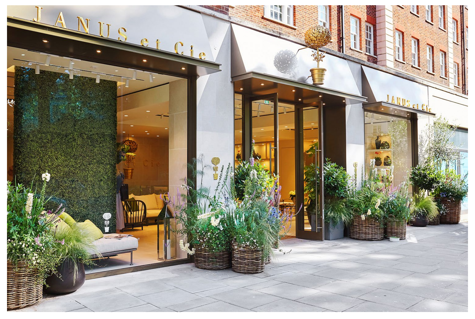
View of the new Janus et Cie showroom in London with a floral installation by Alexander Hoyle.

The Artful Life: 6 Things Galerie Editor's Love This Week - Galerie