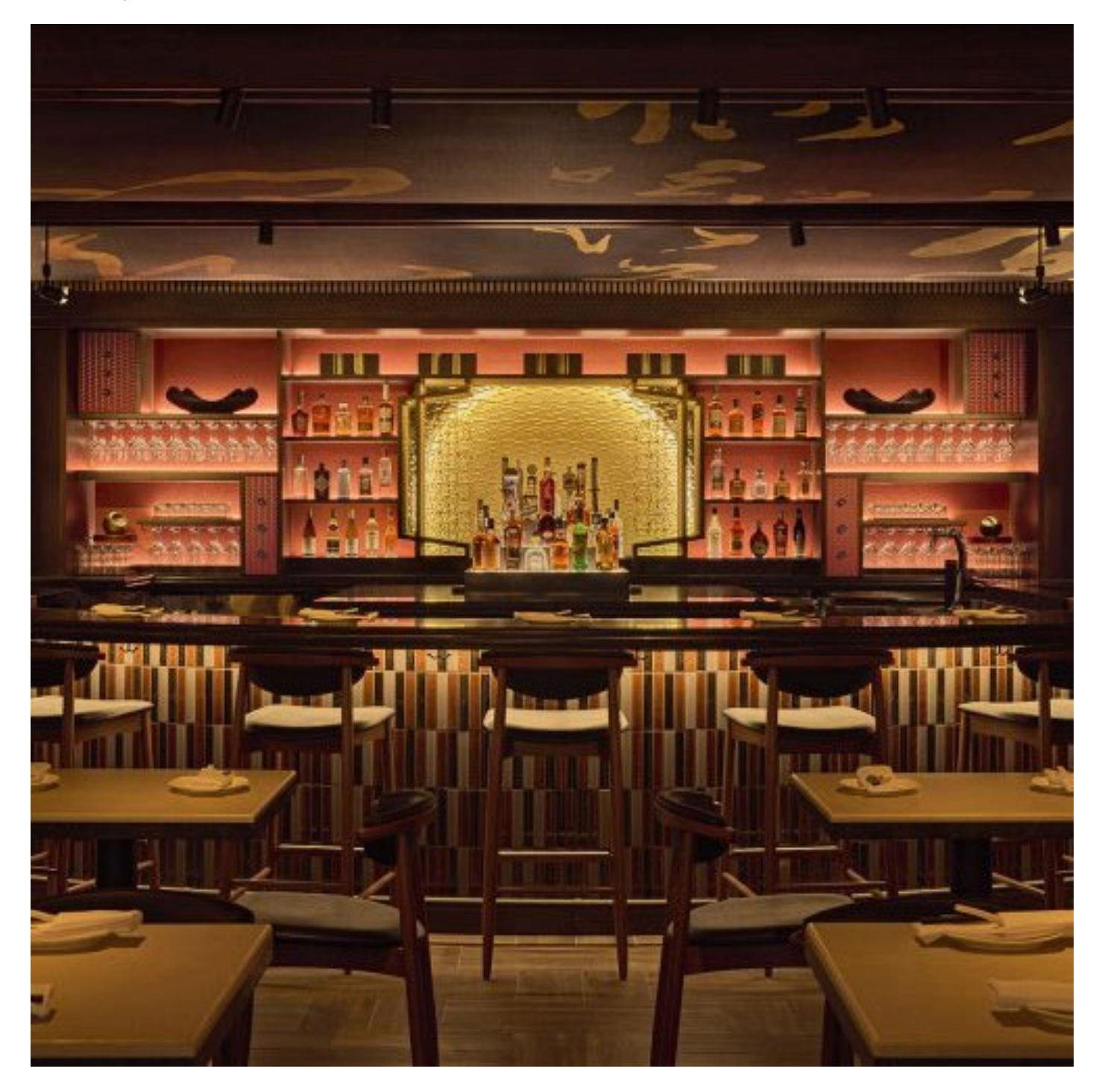
ART + CULTURE The Artful Life: 5 Things Galerie Editors Love This Week