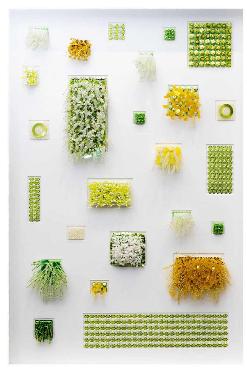
Devi VallabhaneniÕs new exhibition at Helm Contemporary in New York.