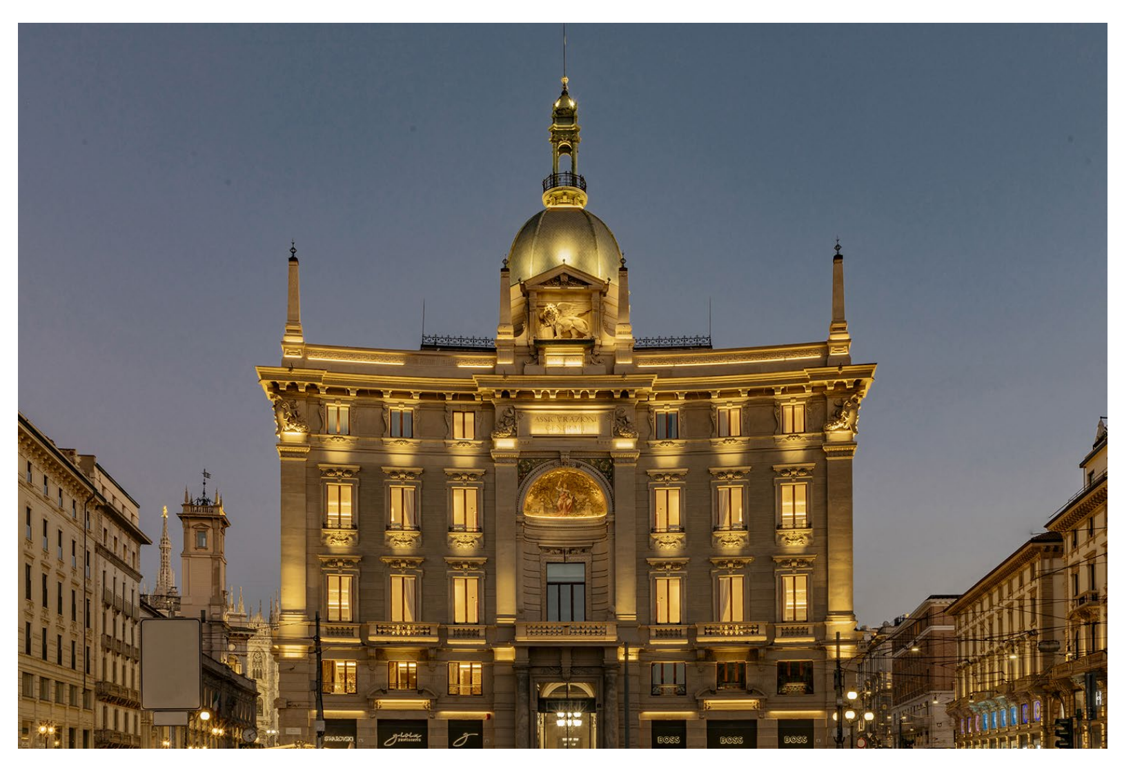
Hotel Melià, Palazzo Cordusio recently opened in Milan.