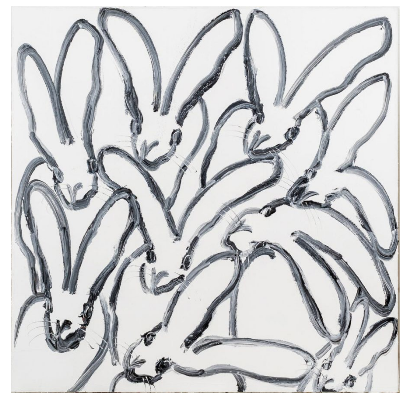
Hunt Slonem has a solo exhibition at Grenning Gallery in Sag Harbor.