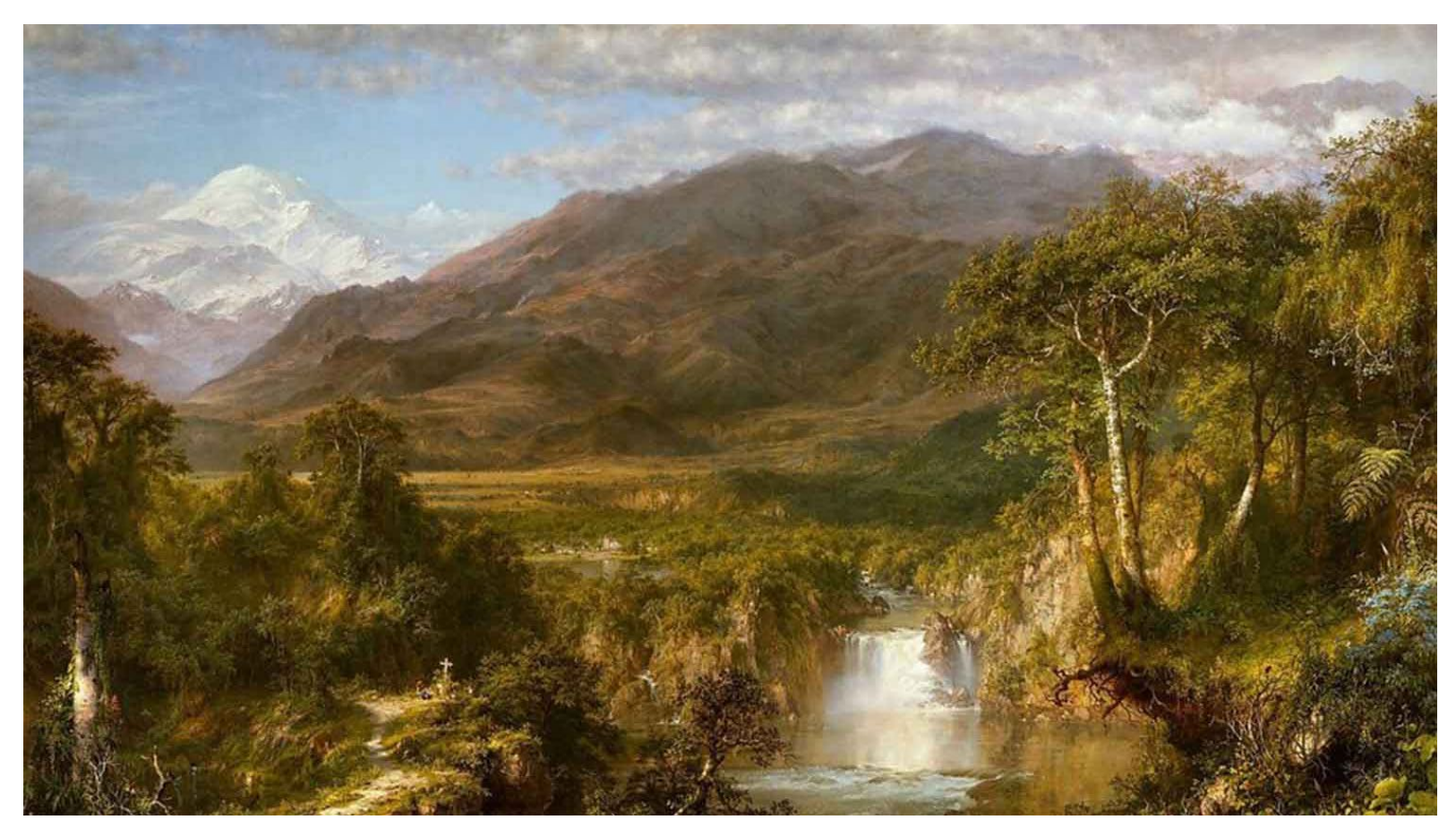
Heart of the Andes by Frederic Edwin Church (1859).

Janus et Cie's latest array of outdoor furniture enchanting ideas about crafting their own romantic setting in the city or country. —Jill Sieracki