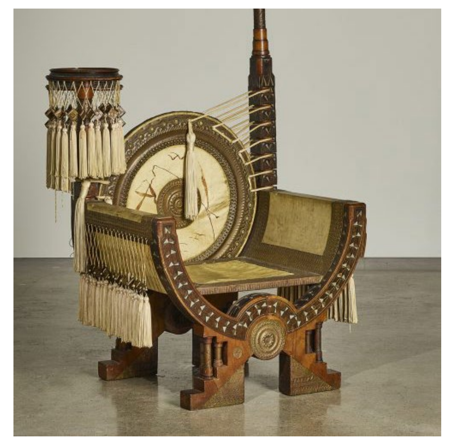
ART + CULTURE

Auction of the Week: Circa-1900 Throne by Carlo Bugatti Sells for Five Times Estimate