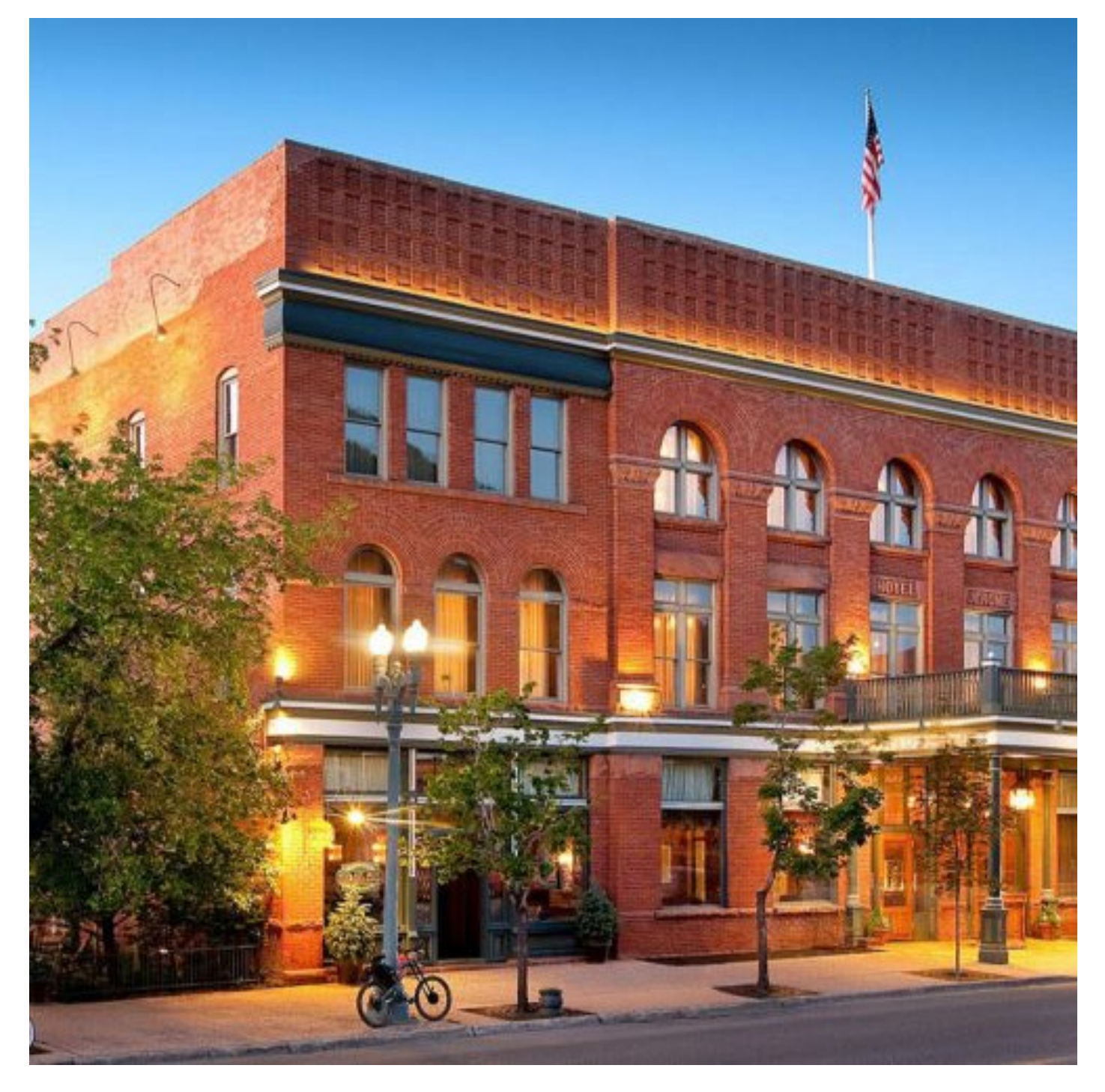
ART + CULTURE 8 Must-See Artworks at the Aspen Art Fair